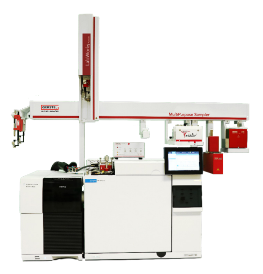
Figure 1: GERSTEL LabWorks Platform with DHS option

GERSTEL LabWorks Platform with DHS on Agilent 8890 GC/5977B Inert Plus MSD shown in Figure 1.