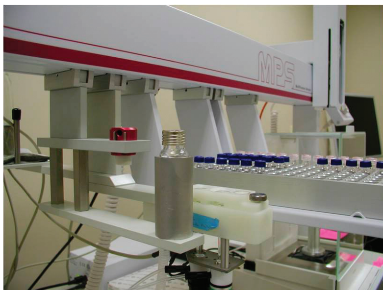
Figure 1: MultiPurpose Sampler (MPS) with the GERSTEL Purge Tool and Balance Options.

All automated liquid transfers and weighings were performed using a GERSTEL MultiPurpose Sampler (MPS) configured with the GERSTEL Balance Option and Purge Tool Option as shown in Figure 1 and Figure 2. Vials containing the liquid standard to be used were placed in a thermostated tray holder on the MPS. Empty vials were capped using magnetically transportable caps and also placed onto the autosampler. The GERSTEL Balance Option incorporated a Sartorius Cubis Balance (model# MSU524S-000-DA) for collection of all weight data.