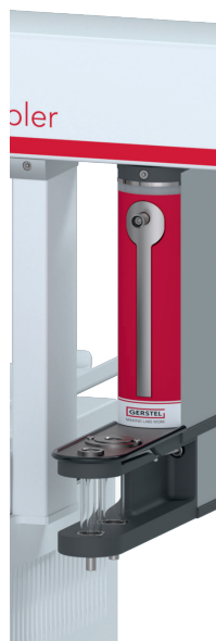
The GERSTEL Wash & Dry station

Experience fully automated SBSE / Twister® workflows with the GERSTEL Auto Twister. Contact GERSTEL today to learn more about upgrading your laboratory!